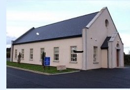
Holy Spirit Oratory